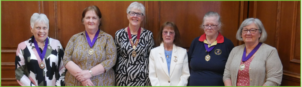
The New National Committee of Ladies' Circles.