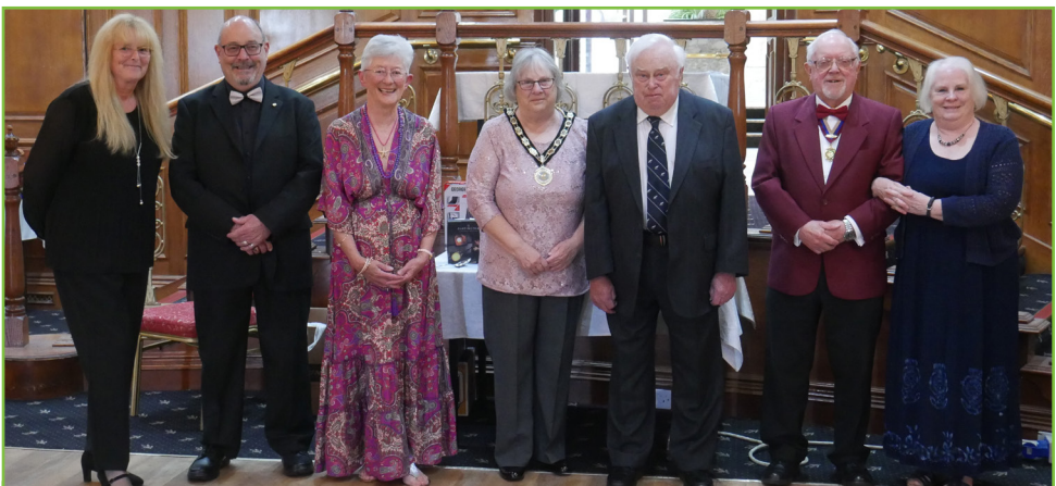
All ready for the Saturday evening at Conference.