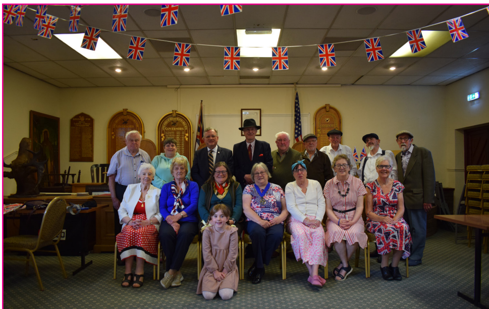
Neath members celebrated VE 80th Anniversary with a tea party.